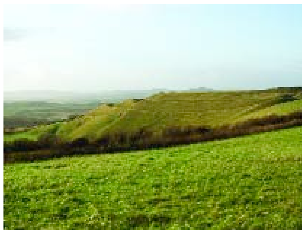
Eggardon Hill, an Iron Age hillfort, commands spectacular views across the AONB.