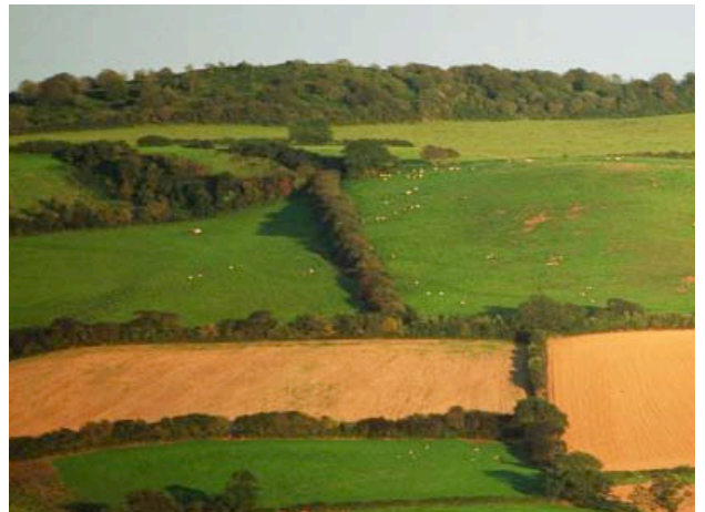
Working together for Dorset's outstanding countryside