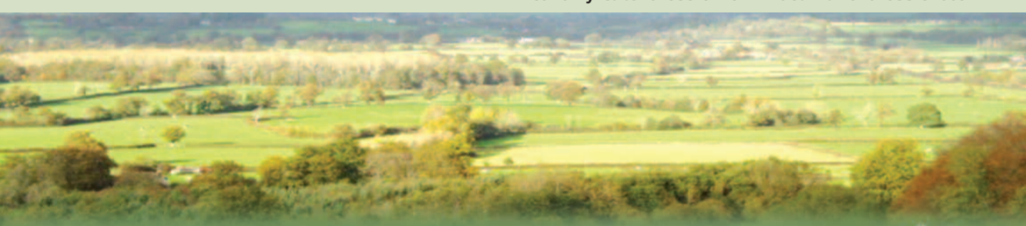
This is the edge of the Blackmore Vale where the fairly flat clay vale is made up of large arable and dairy farms with uniform shaped fields.

These four circular walks take you into spectacular Dorset landscapes with a wealth of wildlife and heritage to enjoy. The walks start at Chetnole, Thornford Halt, Maiden Newton and Upwey stations on the Bristol – Weymouth Heart of Wessex Rail Line and allow you to start and finish your day out with a train ride.