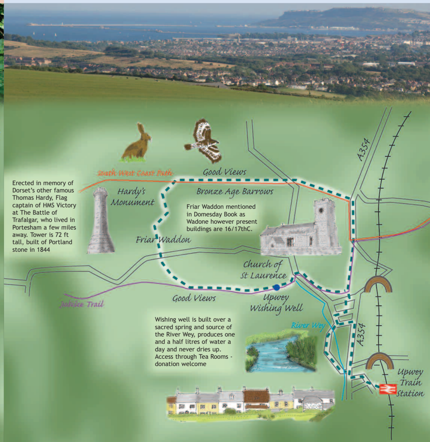
a victorian tourist attraction, sea views and lumps & bumps

Local Taxis: Bee Cars 01305 769900 Central Radio Taxis 01305 781212 Fleetline 01305 784282 Weyline 01305 77777