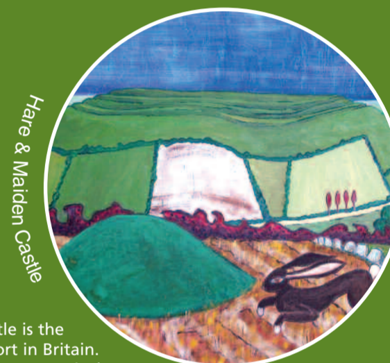
Hare & Maiden Castle

Maiden Castle is the largest hillfort in Britain. Covering an area equivalent to 50 football pitches, some of the ramparts rise to 20 feet or more, even after 2000 years of erosion. Even older, the Bronze Age Barrows of the South Dorset Ridgeway would have been an impressive sight, covered in fresh cut chalk.