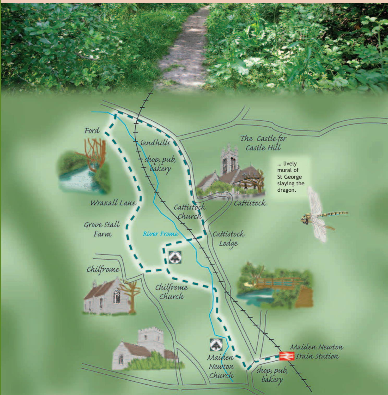
chalk streams, dragonflies and St. George