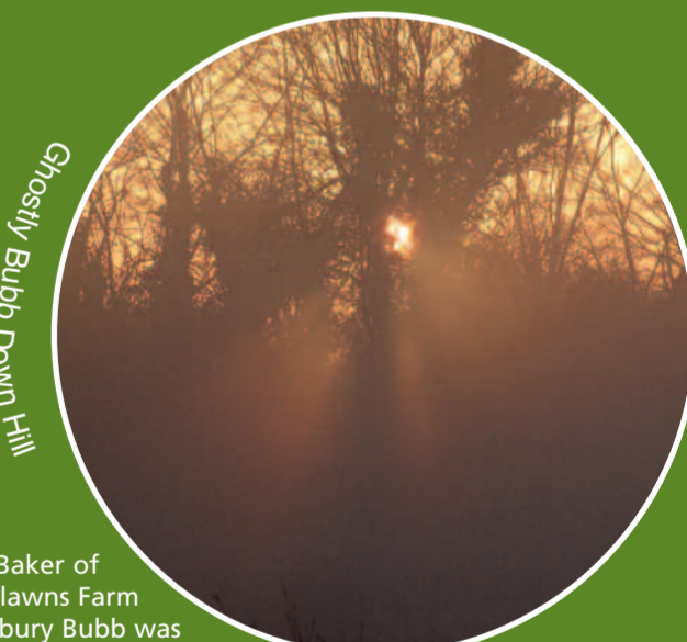
Ghostly Bubb Down Hill

Maiden Castle is the largest hillfort in Britain. Covering an area equivalent to 50 football pitches, some of the ramparts rise to 20 feet or more, even after 2000 years of erosion. Even older, the Bronze Age Barrows of the South Dorset Ridgeway would have been an impressive sight, covered in fresh cut chalk.