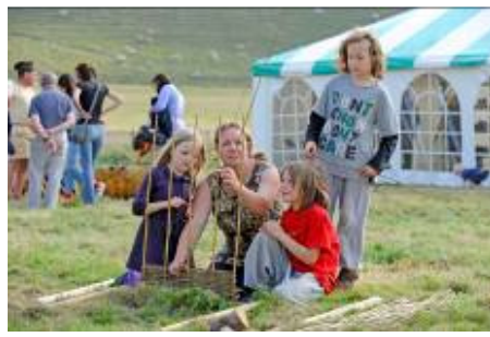
Making a wattle wall for the Bronze Age House